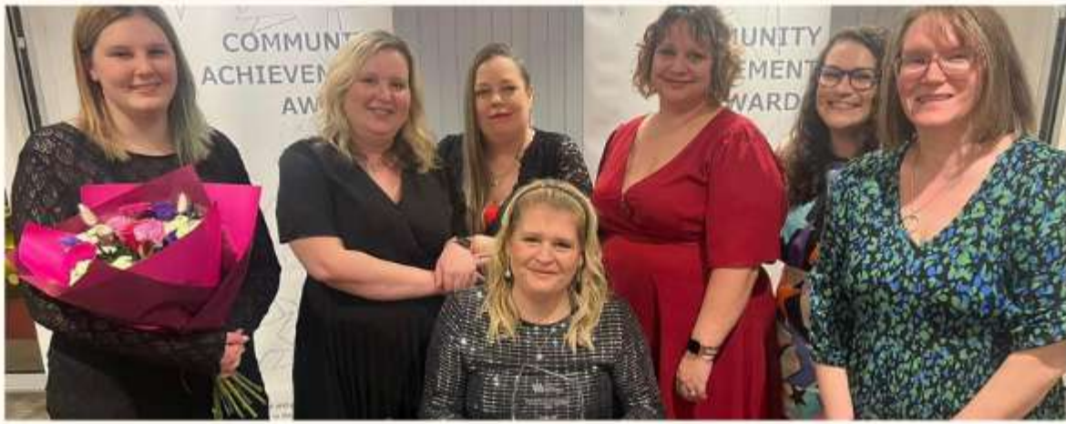
A GROUP OF RANSS AND RPFL STAFF AND VOLUNTEERS REPRESENTED US AT THE AWARDS